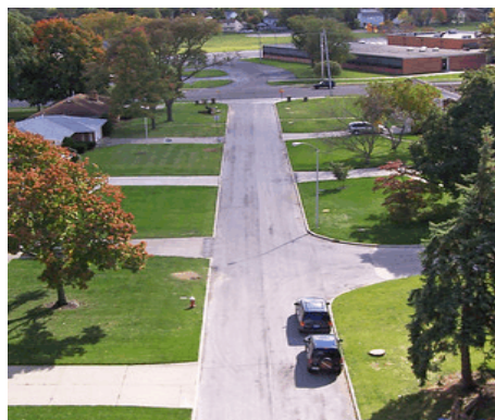
Curbside ash removed due to EAB, Belvedere Dr.