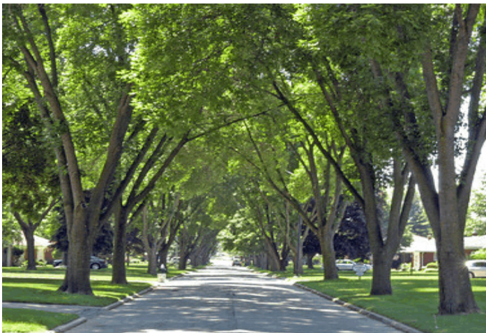
Ash trees before EAB devastation -- Belvedere Dr., Toledo, OH, June 2006.

Since then, university scientists have developed and refined treatment protocols that can protect healthy ash trees from EAB and help conserve the urban forest.