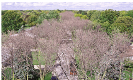
Standing dead ash, Belvedere Dr., Toledo, OH.

*ISA-certified arborist ^ ISA Board-Certified Master Arborist ~ASCA Registered Consulting Arborist