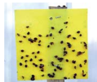
Yellow sticky card, 6" x 6", for monitoring MALB infestation

As part of our research in Minnesota, we found that both yellow sticky cards and visual sampling of clusters were effective at detecting the early arrival and buildup of MALB infestations. Sticky cards allow the grower to monitor changes in the MALB population, with minimal sampling effort (cost)