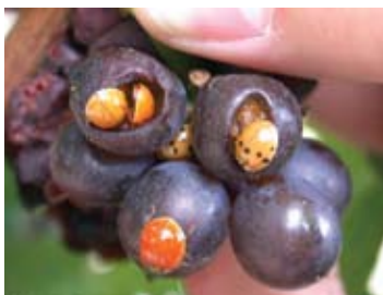
MALB feeding in grapes

Even though MALB can be observed in vineyards throughout the growing season, control measures are not justified until 1-2 weeks before harvest. There are three reasons why grape growers should not manage MALB earlier in the season. First, this insect cannot directly damage, or penetrate grape skins. To date, MALB have only fed on berries that have been previously damaged by other insects, birds, diseases, or “splitting.” Although berries can be damaged as early as the berry set stage,