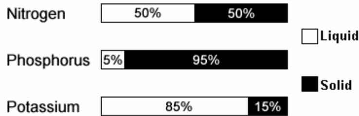
Figure 1. Distribution of nutrients between liquid and solid portions of beef manure.