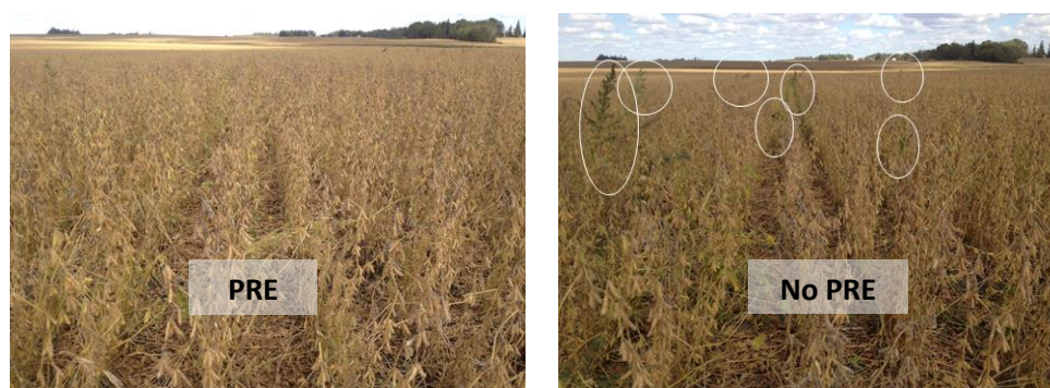
Figure 3. PRE herbicide treatments resulted in lower weed populations at harvest at the Nerstrand location. The weed escapes produced seed, which in turn would be expected to help replenish the weed seedbank and lead to potentially greater weed densities in future years. PRE = Verdict @ 5 oz/acre + Outlook @ 10 oz/acre

Yield: Yield ranged from 45.7 to 67.3 bu/ac, with drought conditions contributing to lower yields at the Pipestone location in 2012 (Table 1). At all locations, yields were not affected by the inclusion of a PRE herbicide in the weed management program.